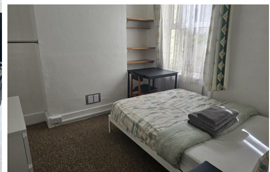
6 Bed House - Terraced located in Brighton